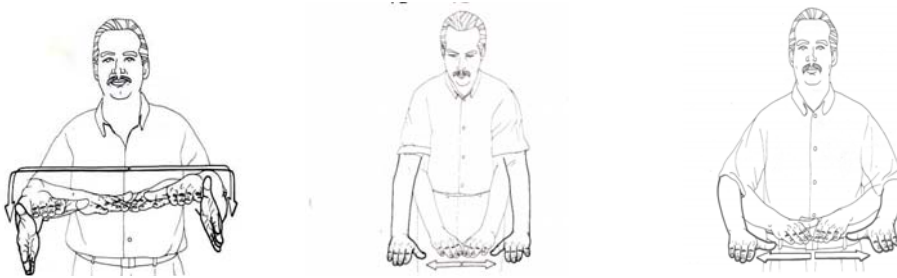
Figure 2. The signs TABLE, FLOOR, CARPET

comparable paradigms to the paradigms of verbal language lexemes which share a common derivative stem. Nevertheless, each of these signs is iconic and visually motivated: iconicity, thus, coexists with the autonomous regularities of the lexical system.