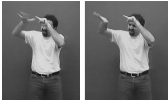
Figure 4. FALLING-LEAF-(FROM-BRANCH)

that in discourse classifiers display a particular kind of dynamic imagic iconicity . The visual features of these forms, and especially the handshapes, can be related to a particular semantic feature of a denotatum in many different ways. We have already noted that in the lexicon the semantic spectrum of a particular handshape may cover different meanings. The semantic spectrum of certain handshapes can be further extended in discourse and acquire particular meanings. An example from a signed narrative will help illustrate this point: