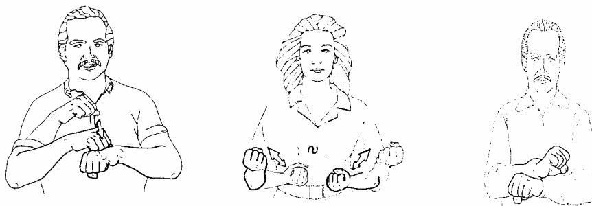
Figure 7. The signs STONE, CAR, PRISONER

Secondly, the selection of the aspects of articulators and referents to be considered as relevant at the linguistic level is arbitrary.