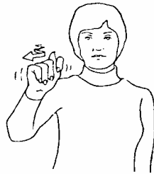
Figure 6. The ASL sign for BATHROOM

preserved in signed languages. Firstly, in a large part of signed language lexicon (i.e. the part that Cuxac (2000) defines “standard lexicon”), the iconicity is “phonemized”. That is, the depiction of referents can only be conveyed by the few formational parameters the language allows. Every sign language, as well as every verbal language, selects its “phonological” patterns arbitrarily. So, for example, the handshape used in the ASL sign for BATHROOM) - figure 6- is not part of the formational parameter inventory of LIS.