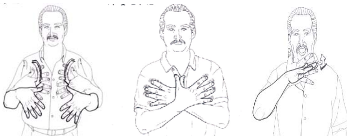
Figure 3. The signs DRESS, BUTTERFLY, WATER

It must be noted that when signs have a common handshape, they do often also share some feature of meaning; however their global meanings differ greatly from one another and are not predictable from the handshape itself. This confirms Peirce's notion that symbolic iconic signs do abstract certain schematic features of their dynamic objects in an ordered and conventionalised manner.