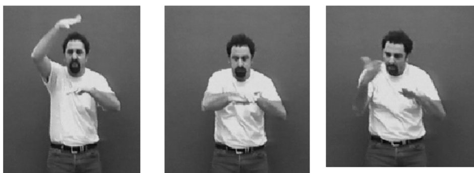
Figure 5. The

signer exploits a 5 classifier to represent a NEWSPAPER on the ground